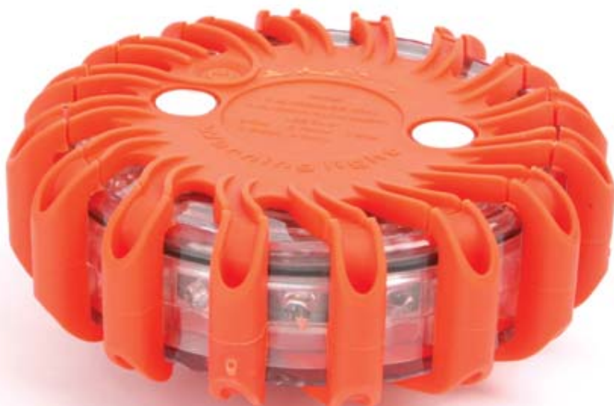
LED Safety Warning Light